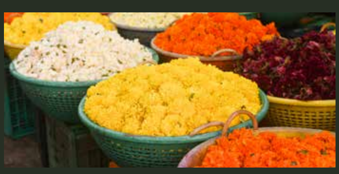
All Images Are Representative Images